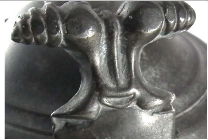
Backview of thumbpiece in private collection looks similar