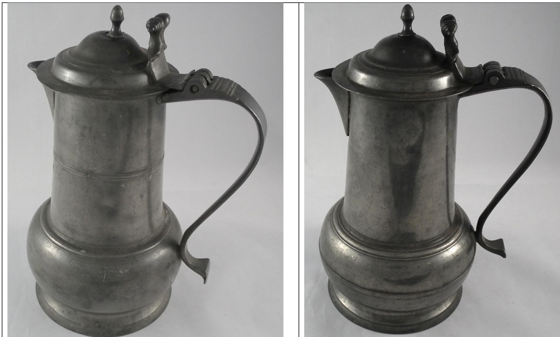
York Acorn Flagons - Two recently seen in a Yorkshire Church