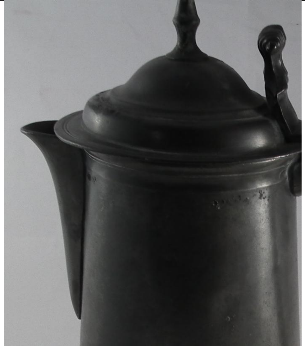
Private collection - "long" spout