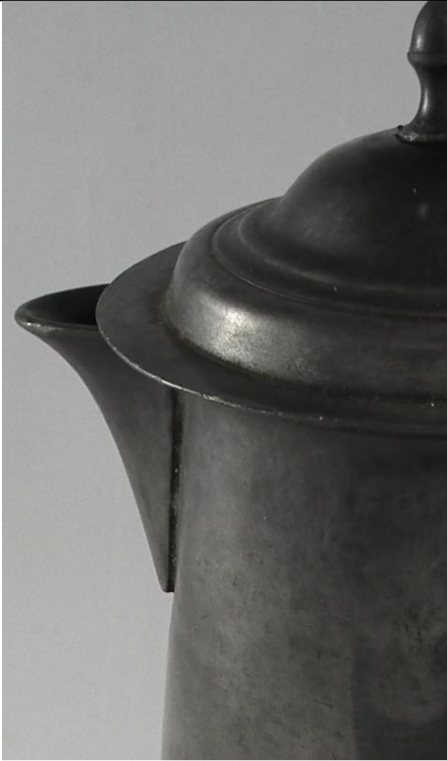
Church flagon - earlier "shorter" spout