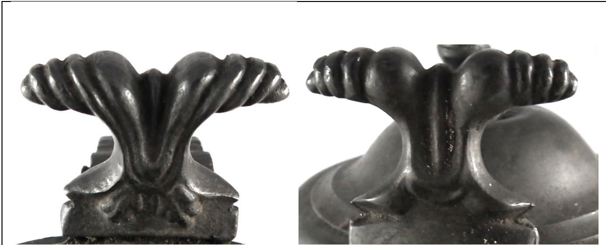
Thumbpiece - as on two York Acorn Church Flagons - front and back