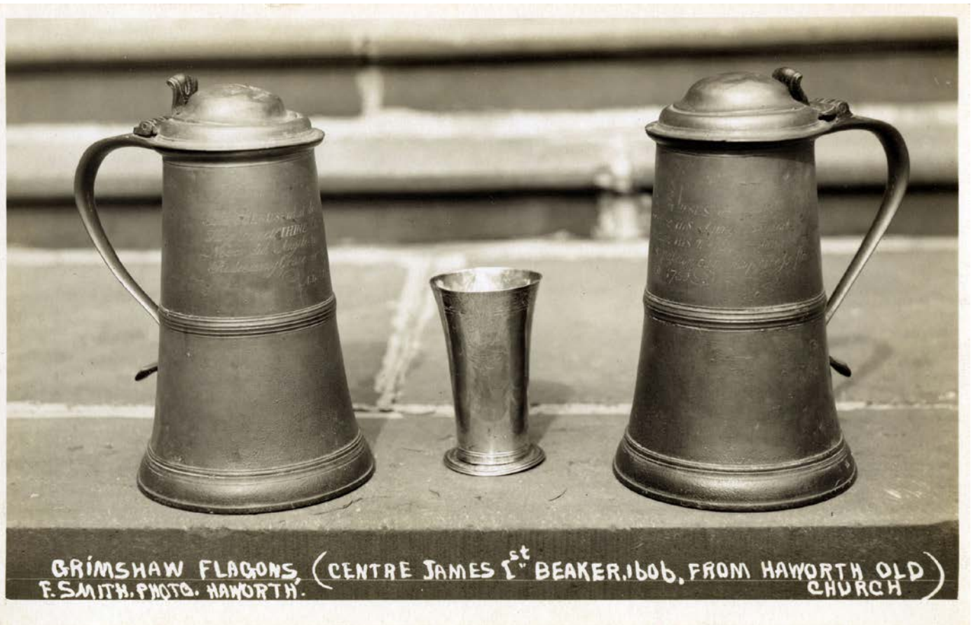
GRIMSHAW FLAGONS, (CENTRE JAMES 1 st BEAKER, 1606, FROM HAWORTH OLD CHURCH)