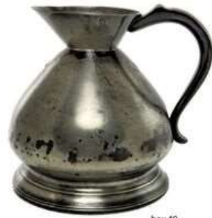
44.0894 box 49