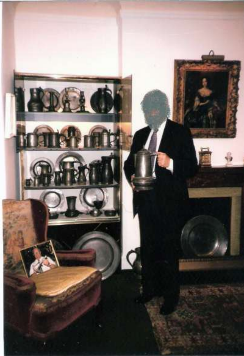
Customer /friend in 1988 considering but did not buy the York Acorn Measure. Note also the posing here of the bell based candlestick photograph on the seat for this photograph.

Just some ten months later another collector, whose face has been concealed (although now passed away) is shown photographed in September 1988 in front of the same cabinet.