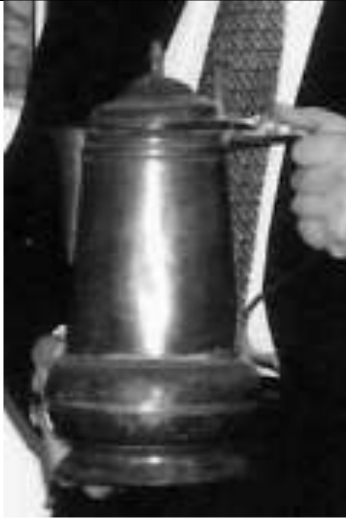
The York Acorn Measure enlarged.