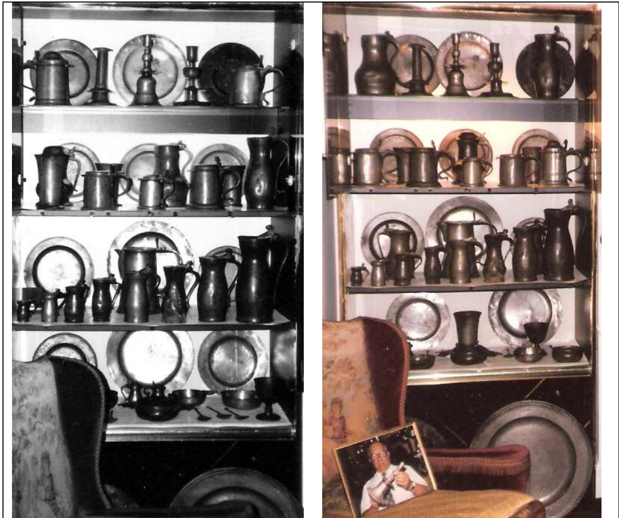
1987 to the left and 1988 to the right

It is interesting to note that the Acorn in the hands of the visiting collector/friend did not come out of the cabinet. Further the contents of the cabinet have changed slightly within a ten month period.