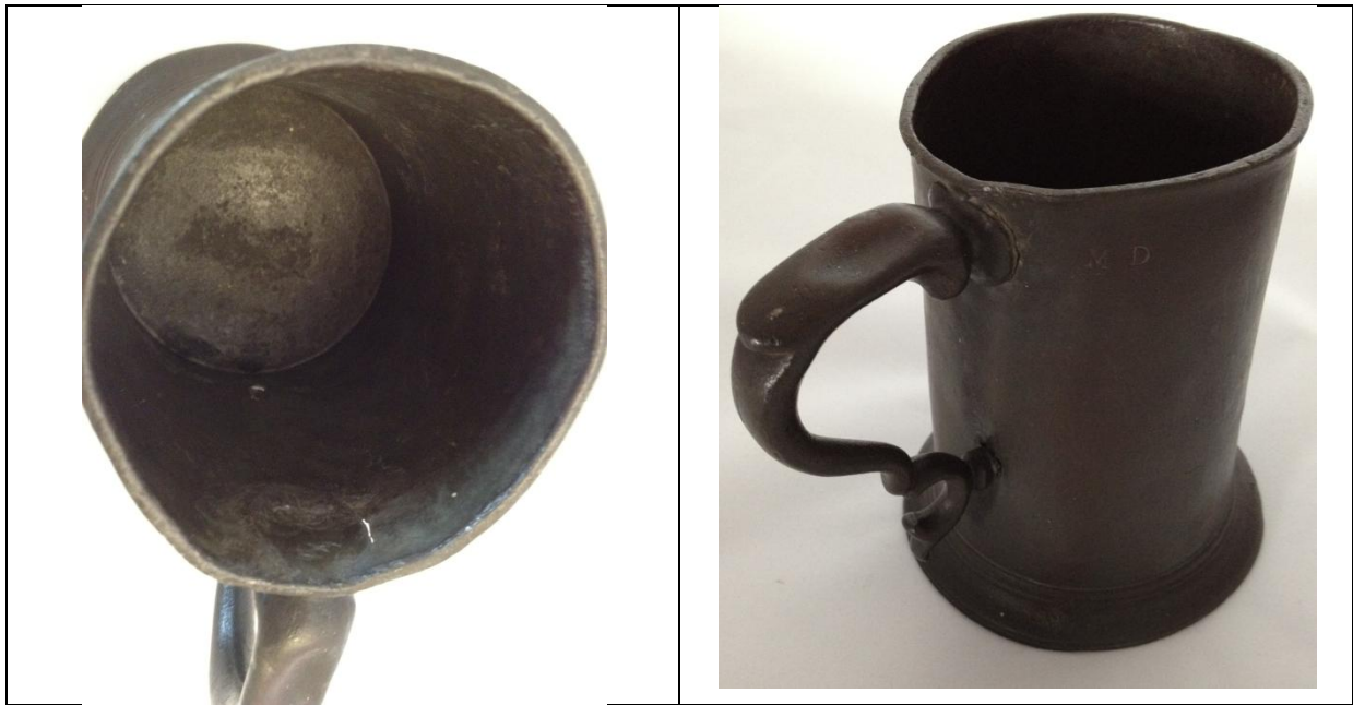
Stage 2 - some attention and repair by A E