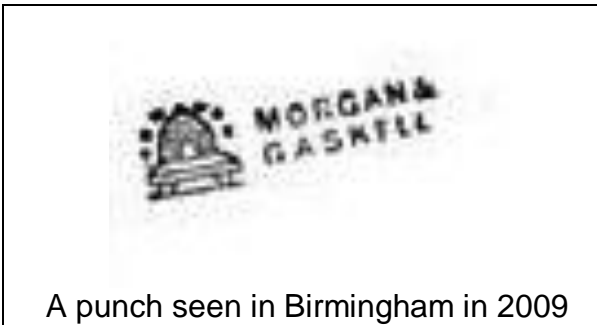
A punch seen in Birmingham in 2009