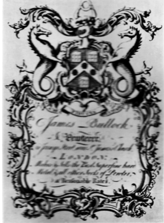
2. JAMES BULLOCK (No. 685 q.v.)