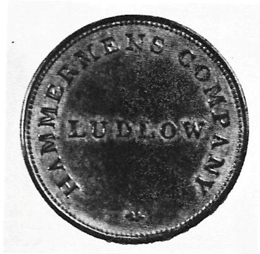
24. MEMBERSHIP BADGE OF THE LUDLOW GUILD OF HAMMERMEN. See p. 14.