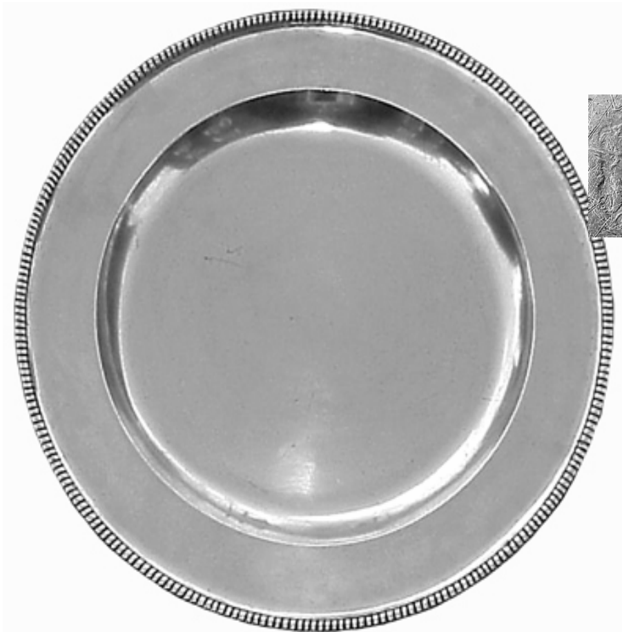
Beaded edge charger by Thomas Goodwin, c1710-16.