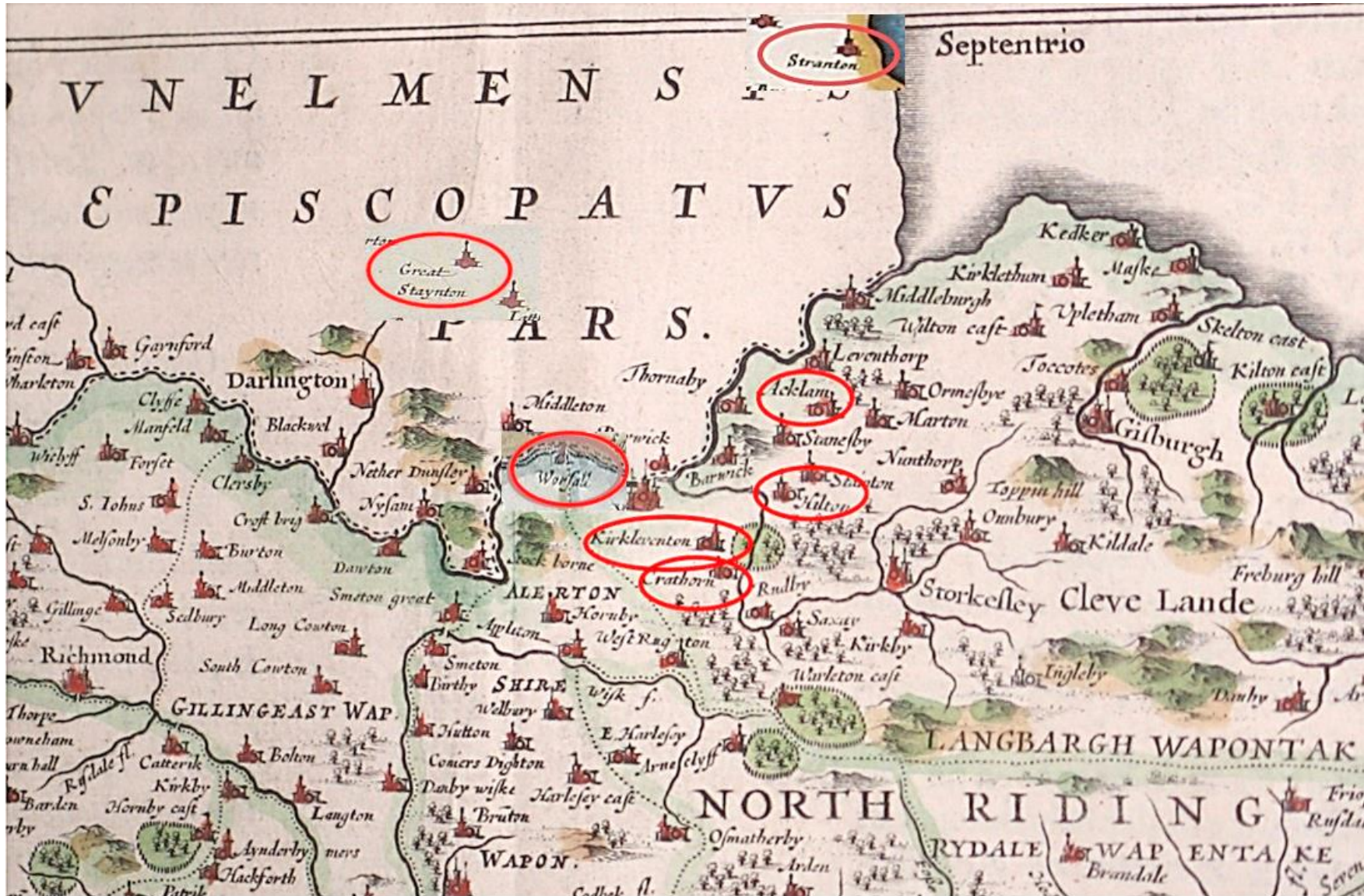
1645 Blaeu Yorkshire