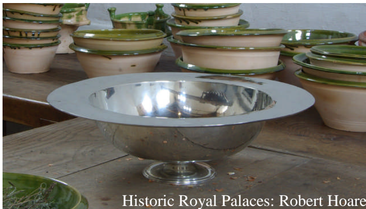
Code 105 15" Bowl 19" rim on foot