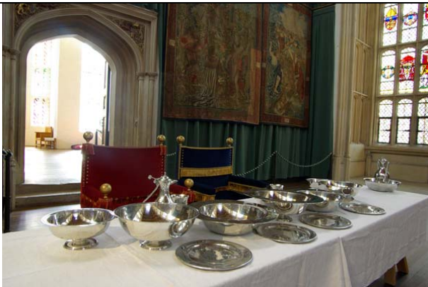
TOP TABLE SETTING