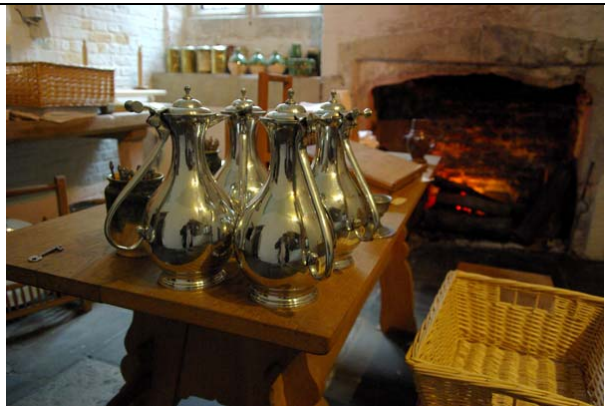
WINE JUGS AS FOR HAMPTON COURT