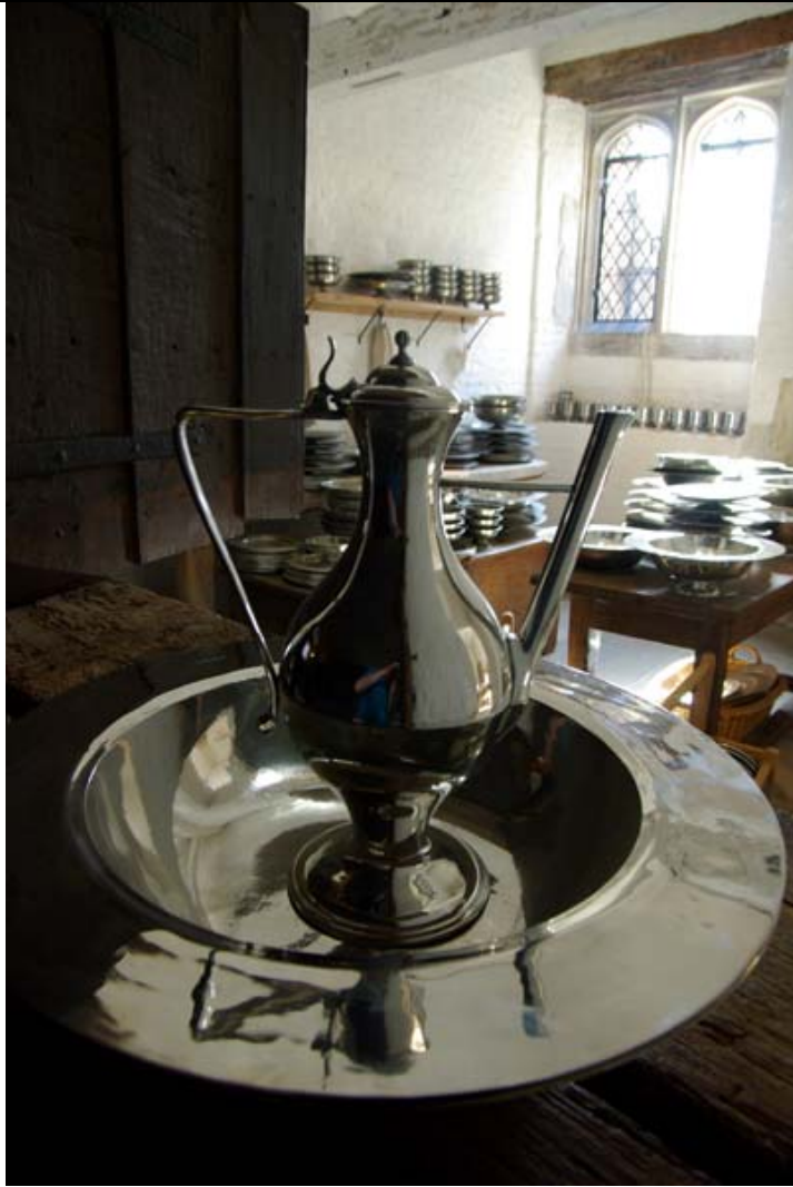
JUG AND HATCH