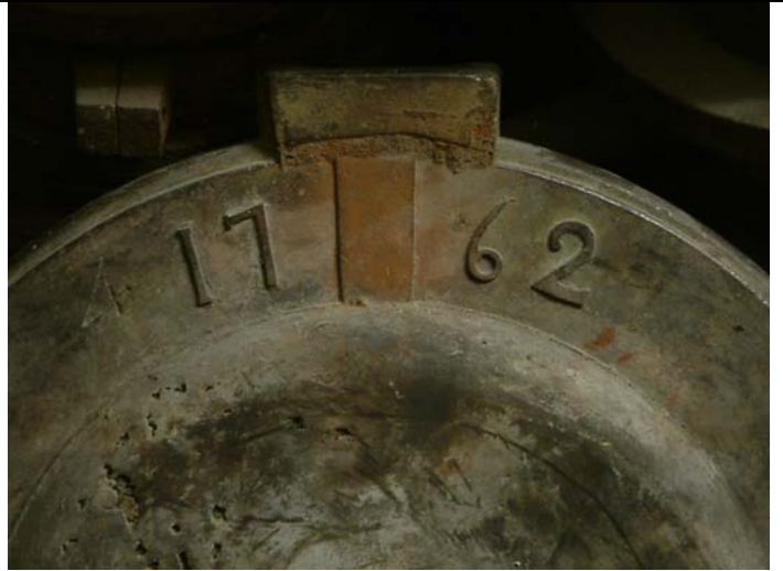
MOLD - 1762