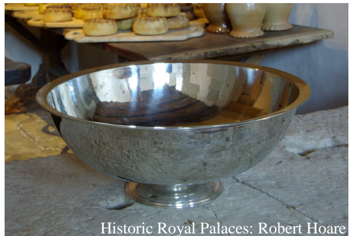
Code 103 14" Footed Bowl on foot

A E Williams 6 Well Lane ♦ Digbeth ♦ Birmingham B5 5TE T: +44(0)121 643 4756 ♦ F: +44(0)121 643 2977 ♦ E: sales@pewtergiftware.com