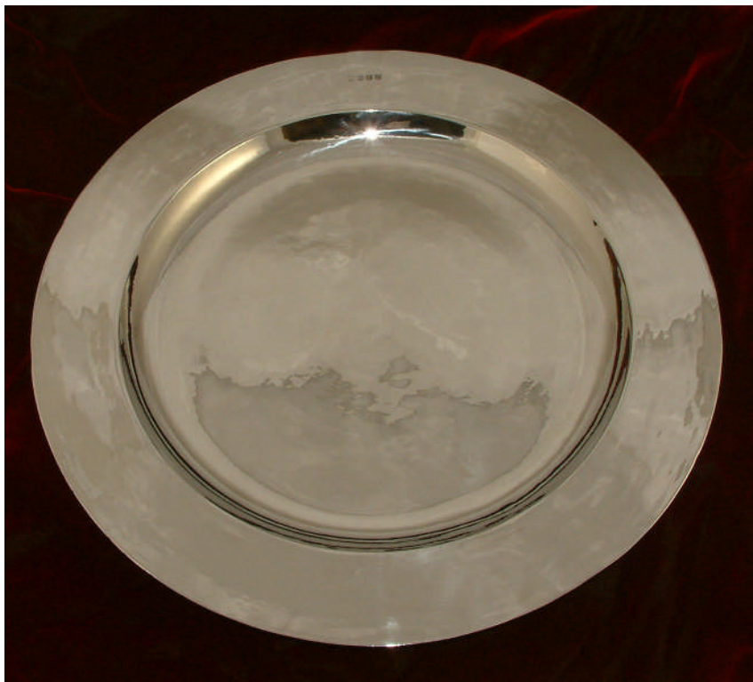
Code 112 19" Charger