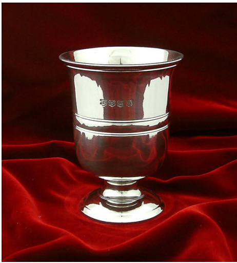
Code 106 Tudor 1 pint Goblet