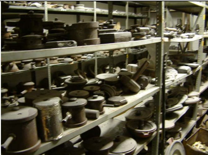
SHELVES OF PEWTERERS MOLDS