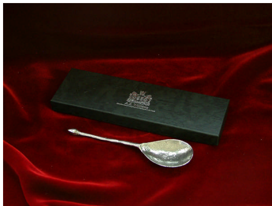
Code 113 Well Spoon