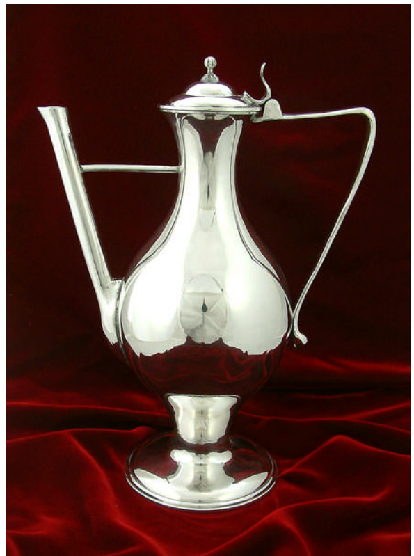
Code 110 Water Ewer See It being made http://www.youtube.com/watch?v=FVVUGJaK8Bg