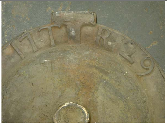
MOLD - 1729